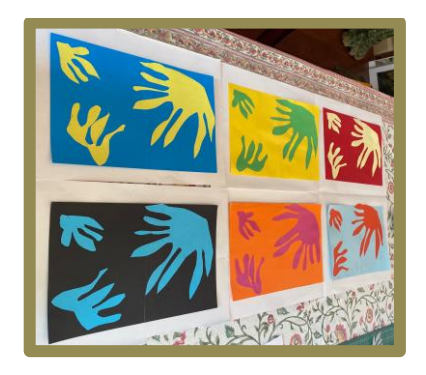
By Heather Honour